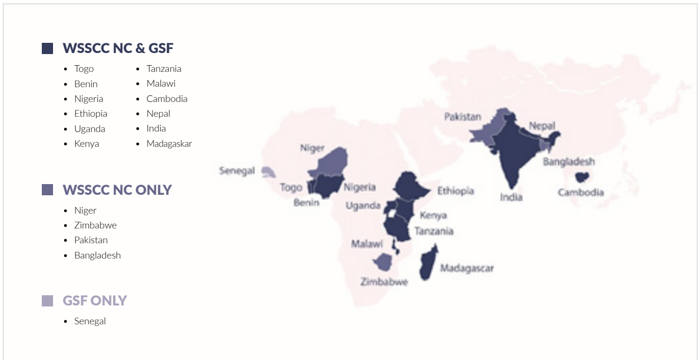
Countries of WSSCC engagement