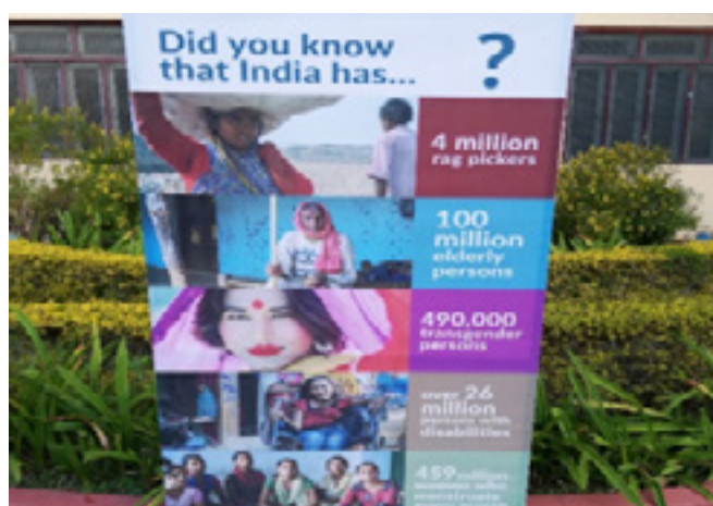
Billboard with data on vulnerable groups in India. Picture taken at LNOB Summit in Rishikesh, India, 16 – 18 December 2019: WSSCC supported the organization of LNOB consultation with 14 vulnerable population groups on SDG 6. The report is shared with the UN Country Team in India as input in the national report of India for the 2020 Voluntary National Review of SDG 6