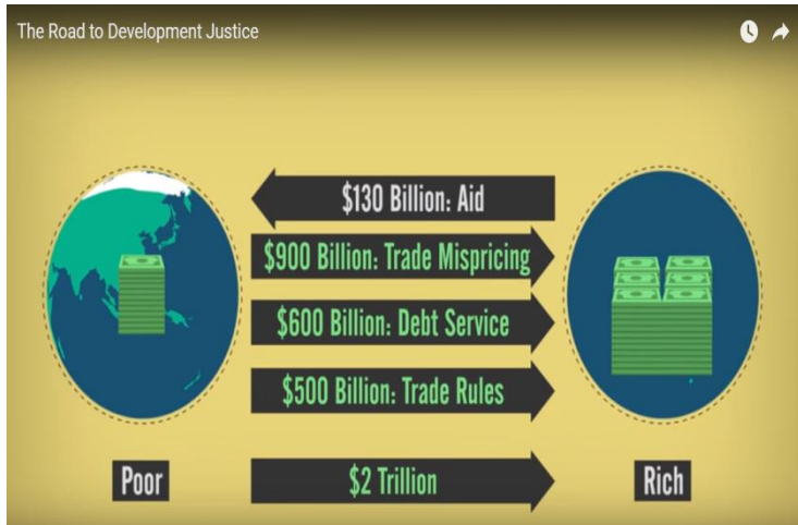
Figure 3: Road to Development Justice

The global north continues to bleed the global south. The value of ODA has remained unchanged for 5 years. More resources have been flowing out of developing countries than in. ODA's role is being downplayed, and MOI focus is moving to FDI, remittances and domestic resources. Donor countries are introducing capacity building and technical assistance, undermining ownership. OECD calculation of ODA contributing to SDGs includes scholarships and peacekeeping activities (legitimizing military expenditure). ODA to PPPs is also increasing, favoring commercial interests of donors.