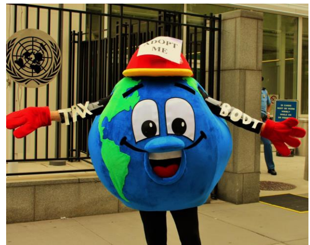
Figure 2: Lobbying for an international tax body

No development can be financed without taxes. A progressive tax system depends on taxing rich more than the poor. It can help investment in infrastructure, improve governance, reduce corruption. However, globally there are very low levels of corporate and income tax. Countries compete to offer lower taxes until they give tax breaks to people in a position to pay. Economists say that there will only be Foreign Direct Investment (FDI) if there are low taxes, but FDIs depend on local markets and skill levels in countries. Further Special Economic Zones (SEZs) are given tax (and labour) exemptions. There are global tax losses in extractive industries. Illicit financial flows exploit tax loopholes to the point where 1 trillion USD is lost to every year. Asia accounts for nearly half of this - USD 482 billion – and China alone one-fourth. Tax is considered the traditional MOI for development and Target 17.1 talks about strengthening domestic resource mobilization. UNCTAD estimates it will take USD 3.3-4.5 trillion annually for developing countries to meet SDGs.