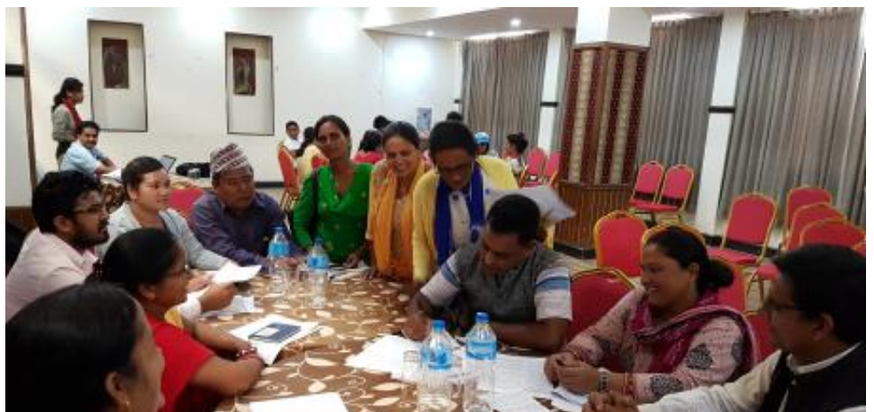
Community members are assessing the threats to community conservation during a community assessment.

Local communities and rural women groups play a critical roles, now more than ever, in achieving the SDGs. Their recognition as stakeholders and their perspectives in reporting the progress towards implementing the SDGs and the VNR process is required. We call for a national database and accounting system to be established that will allow meaningful consideration of community contributions, perspectives, experience, and knowledge, in order to realise the SDGs.