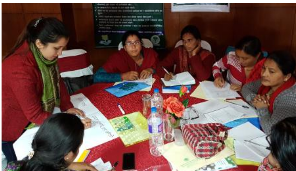
Members of Community Forest User Groups are assessing gender mainstreaming in community conservation.