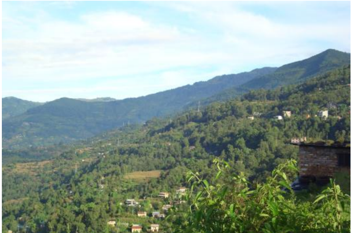
A community forest managed by community forest user groups in the Dolakha district of Nepal.

Additionally, the VNR lacks analysis on the coordination mechanisms within and between these partners and Government agencies that are responsible for the implementation of the SDGs. The VNR has not