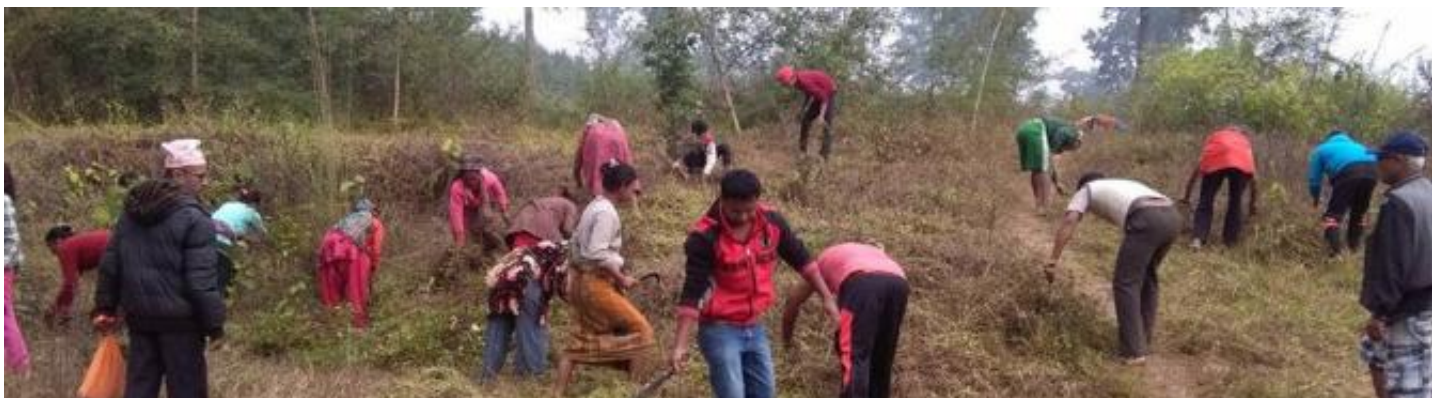
Members of community forest user groups are managing their community forest in Nawalparasi district.

The Government of Nepal can achieve the SDGs through participation and inclusion of these local community and rural women's groups. However, the Government has not developed any effective and participatory mechanisms to take into account these community contributions. There was very low participation from local communities and rural women during the national VNR process. The National Report on the Implementation of the SDGs in Nepal has undermined and not counted community contributions to achieving the SDGs in Nepal.