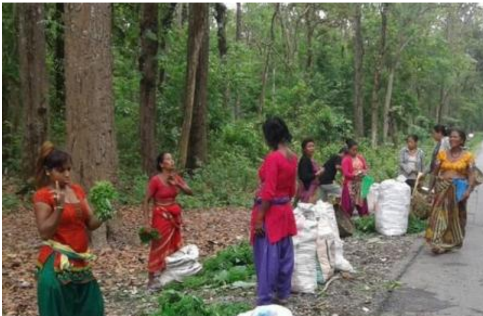
Women members of community forests are collecting Niguro ( Dryopteris sp ) in kanepokhari of Morang district.

Women are creating strong spaces at the community level through community-based natural resource management groups and different cooperative organisations. Many community groups have been exclusively managed by women or under the leadership of women particularly in rural and urban areas. Therefore, women's groups want to see their contributions in the VNR report through an appropriate consultation process. However, in the case of Nepal, due to lack of consultation at the local level particularly with women's groups, their contributions, concerns, and agendas have not been reflected in the VNR report of the country.