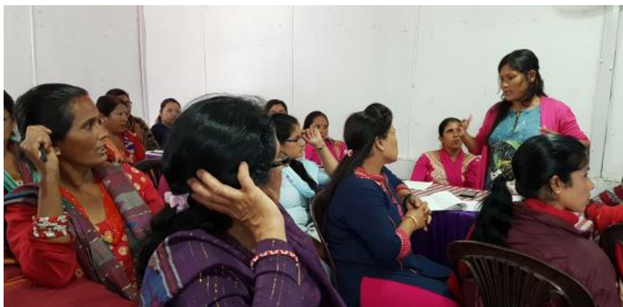
Members of a community forest organisation are discussing the threats to women-led, small-scale forest enterprises in Kavre district.

these opportunities are not recognised in the VNR report.