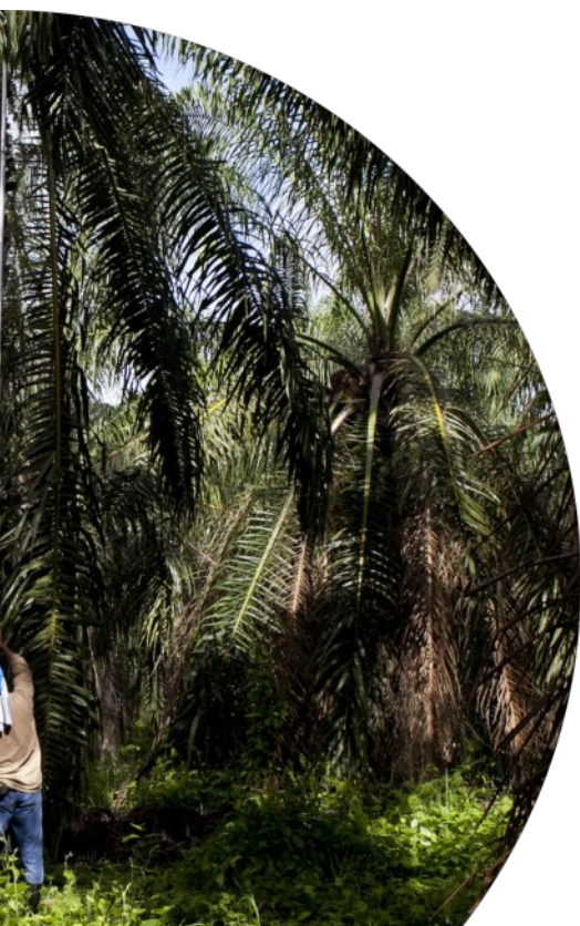
Harvesting from oil palms in Colombia.

Furthermore, the government adopted a Green Growth Strategy as a cross-cutting approach aimed at ensuring that the natural resource base will provide the ‘goods and services’ required for reaching ‘sustainable economic development.’ [12] This approach, based exclusively on the economic aspects of natural resources, is highly detrimental for the livelihoods of people, especially economically marginalized rights holder groups, and for ecosystems which will be discussed in the following section of this report.